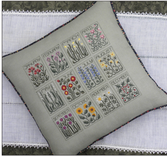
14" x 14" Cushion