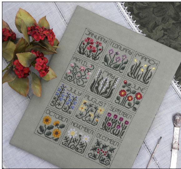
9" x 12" Folio